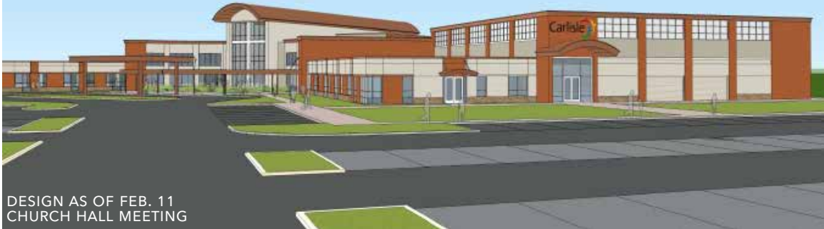
DESIGN AS OF FEB. 11 CHURCH HALL MEETING

One of my all-time heroes of the Olympics has been Tanzanian runner, John Stephen Akhwari. At the 19-kilometer point during the 42 km marathon race, he fell, dislocated his knee and injured his shoulder. He, however, continued running and finished last among the 57 competitors who completed the race. When interviewed later and asked why he continued running, he said, "My country did not send me 5,000 miles to start the race; they sent me 5,000 miles to finish the race." Akhari's words seem to identify exactly where CUMC stands today. God didn't just bring our three churches together to start